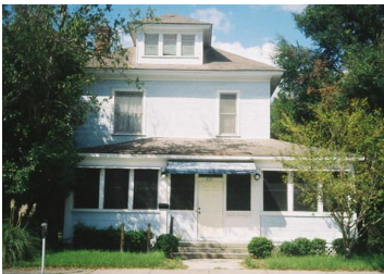
The Jubilee house located at: 218 NW 2nd Avenue Gainesville, FL 32601

After returning to Gainesville in August, I will be moving into the Jubilee House. The Jubilee House is a house of hospitality here in Gainesville and is a part of the Catholic Worker Movement. As a part of the in-house community I will be responsible for offering hospitality to guests, as well as be involved in regular activities of the house including things such as: Breakfast Brigade, Dorothy's Café, Bible studies, morning prayer, and roundtable discussions. Breakfast Brigade happens twice a week and is a time when healthy, homemade breakfast is prepared and served at local labor pools. Dorothy's Café is a large meal served at the house three times a month to anyone in need of a meal. Café is a time to share a meal with our friends that may be homeless or impoverished. An important part of what we do at the