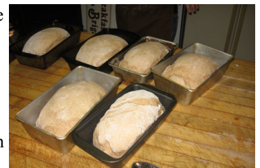
Fresh baked bread which is a staple at Dorothy's Café and Breakfast Brigade. It's delicious!