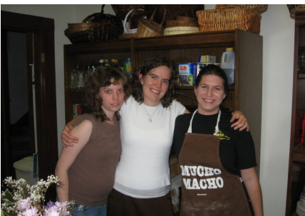
Two girls, who have lived at the house in the past, with me at Dorothy's Café.

I have learned a lot from being apart of this community over the past year and a half; I look forward to living in the house and being shaped and refined by the experiences I will have and the relationships I will build and strengthen. If you would like to learn more about the Jubilee House or the Catholic Worker Movement you can visit the following websites: http://gvillecw.wordpress.com/ and http://www.catholicworker.org/ .