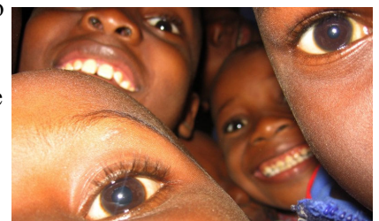
Some of the beautiful children at Hananasif.

After finishing up my research in Tanzania, I will be spending almost a month volunteering at Hananasif Orphanage Center. Hananasif is an organic, Christian, development-oriented ministry serving orphans and street children in and around Dar es Salaam, Tanzania. Hananasif has two locations. One location is within the city of Dar es Salaam where 21 younger children are cared for. The other locations is in the rural Mkuranga District outside the city. There is a secondary school at this location where 70 orphan children live and are able to attend school for free. The center outside the city is located on 300 acres of land. There is an agricultural program that is apart of the school curriculum. The students take part in growing fruits and vegetables. The center is really striving to become sustainable and this farming provides food for the children and in the future will provide income for the orphanage. I will spend my time at the rural location and I will help out in the secondary school and will also work on the farm.